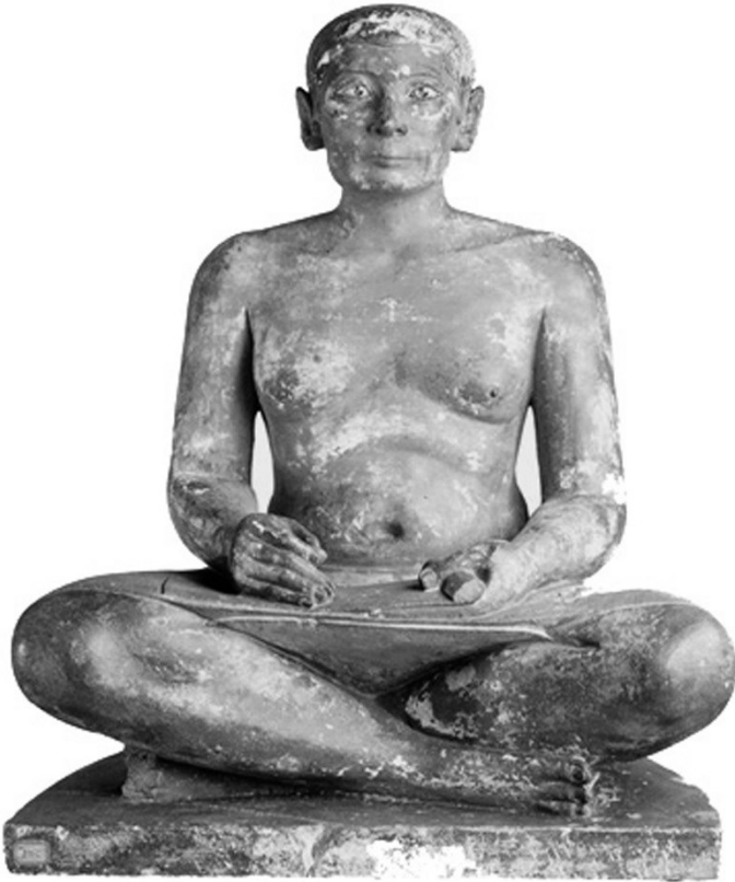
the Scribe of Saqqara IVth or Vth Dynasty Louvre