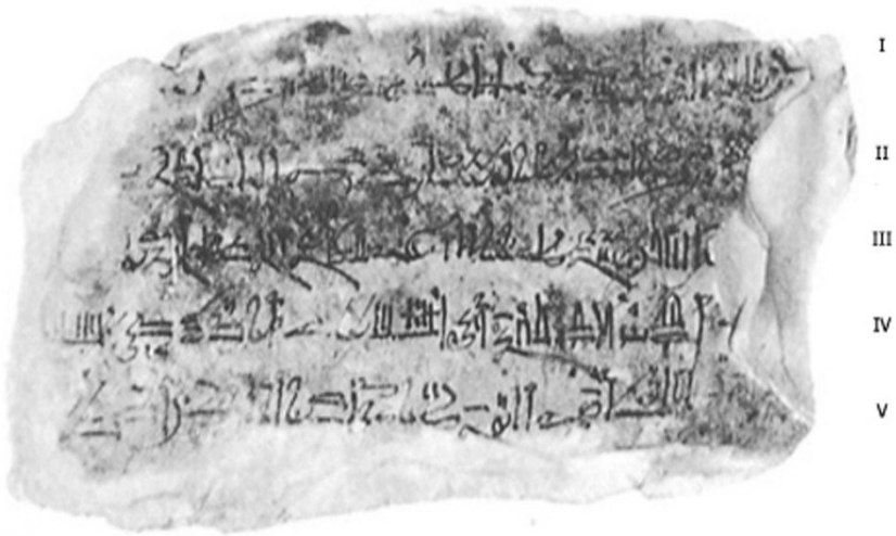
Munich Ostrakon 3400